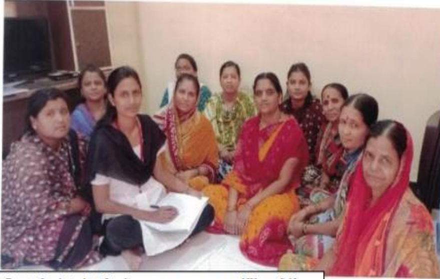
Report of students about Legal awareness among women and Women Self Help Group & free Legal Aid & students explained contents of pamphlets which are provided by R.S.Law College, Barshi, Taluka Legal Services Committee, Barshi & DLSA, Solapur. A Y 2021-22

Photo / Letters /Attendance sheet/Certificate/ Feedback/Account document etc.